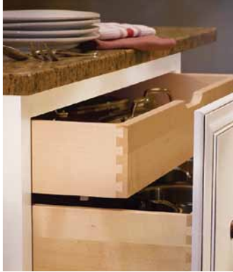
Drawer box upgrades