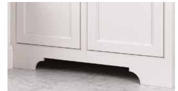
Shaped bottom rail