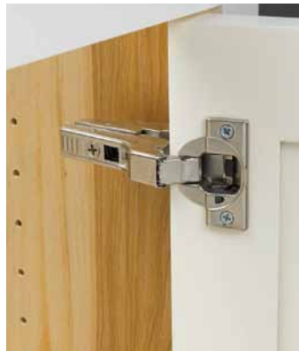
Blum inset hinge