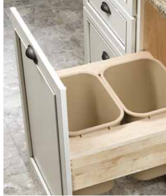
Trash can pull-out