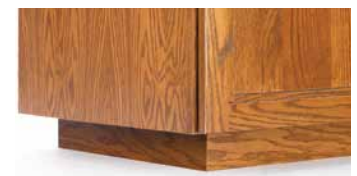
Side toe space