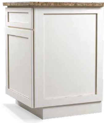
False door side